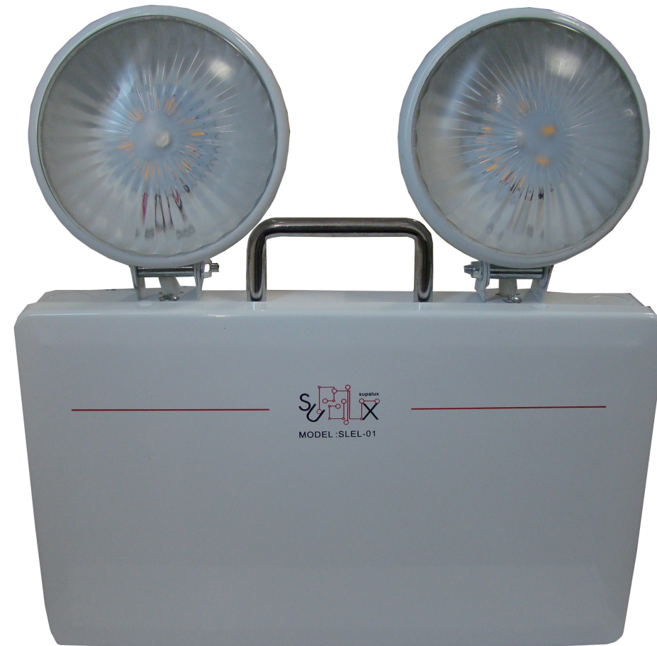
DIMENSION (mm) BOX : L266.3 x H161.5 x W46 mm, LIGHT HEAD: D100 mm