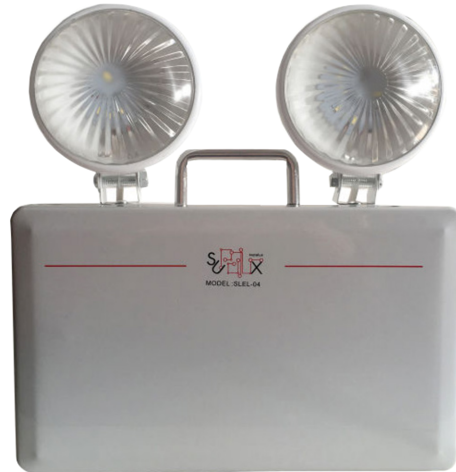
DIMENSION (mm) BOX : L266.3 x H161.5 x W46 mm, LIGHT HEAD: D100 mm